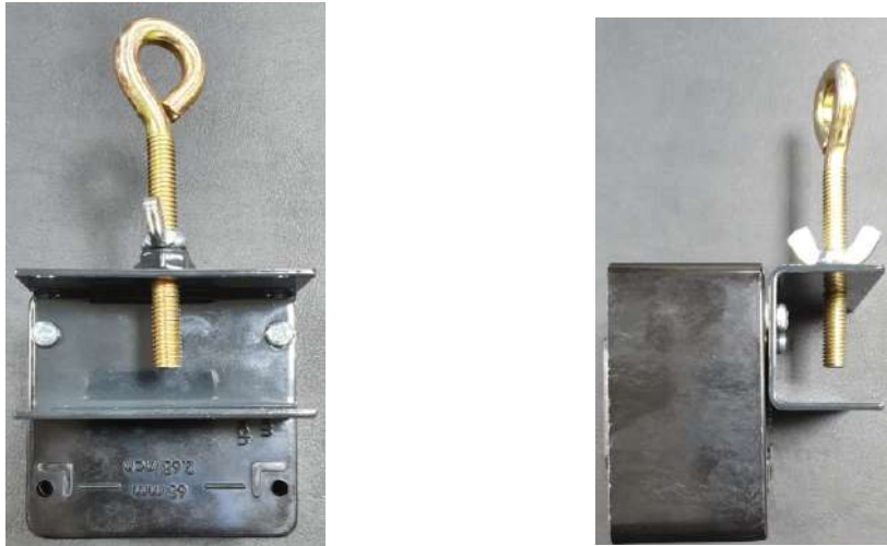
Fig.2 ROSSMA IIOT-AMS TILT COUNTER Mounting type for tilt mechanism